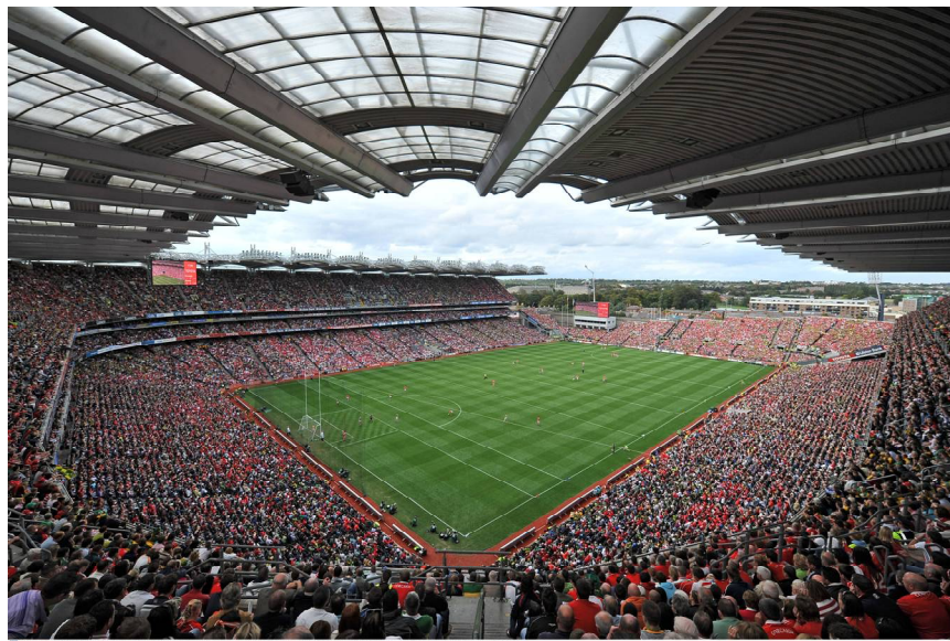
SPORTS ILLUSTRATED 29 September 2011 A general view of Croke Park during the match, GAA Football All Ireland Senior Championship Final, Kerry v Cork, Croke Park, Dublin.